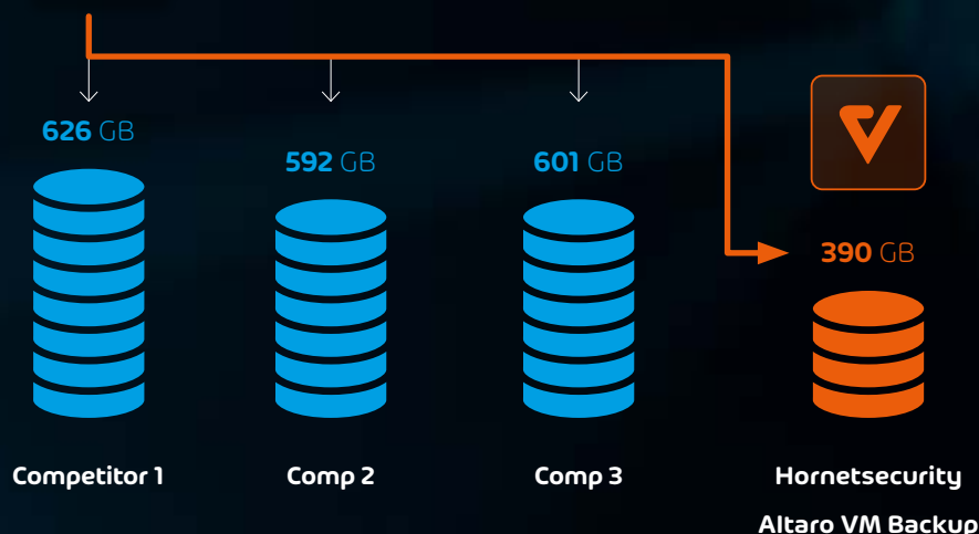
Figure 1: When compared to other vendors, the Augmented Inline Deduplication is the best in the industry creating the smallest backup size